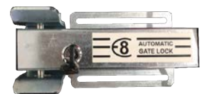
Electric gate lock